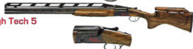
High Tech 5