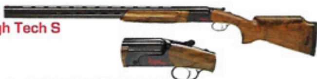
High Tech S