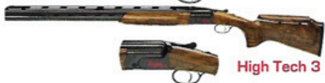
High Tech 3