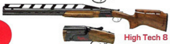
High Tech 8