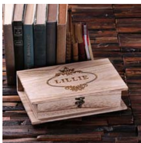
Engraved on Box: