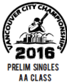
Engraved on Opener: