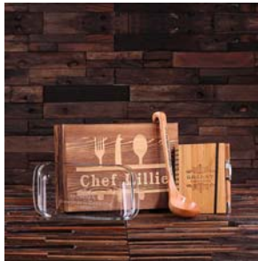
Engraved on Box & Pyrex: