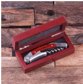
Engraved on Box: