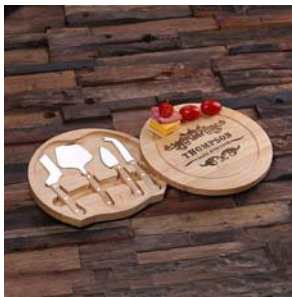
Engraved on Board: