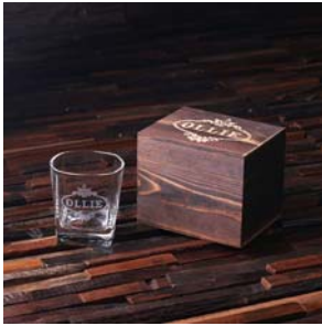
Engraved on Box: