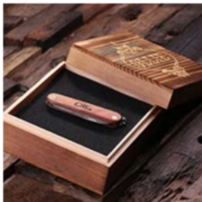
Engraved on Box: