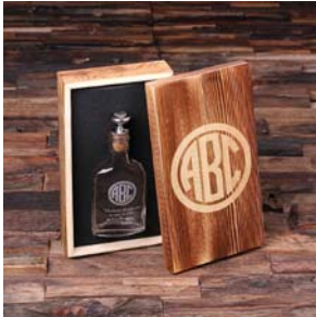
Engraved on Box: