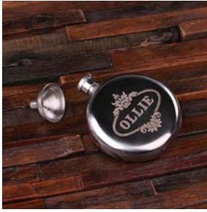
Engraved on Flask: