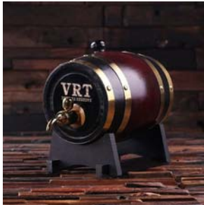
Engraved on Barrel: