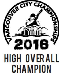
Engraved on Book: