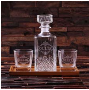
Engraved on Tray: