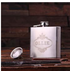
Engraved on Flask: