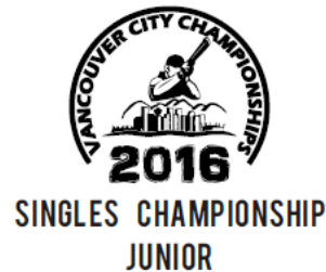
Engraved on Knife: