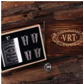
Engraved on Flask & Box: