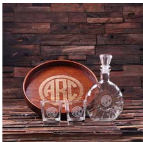
Engraved on Tray: